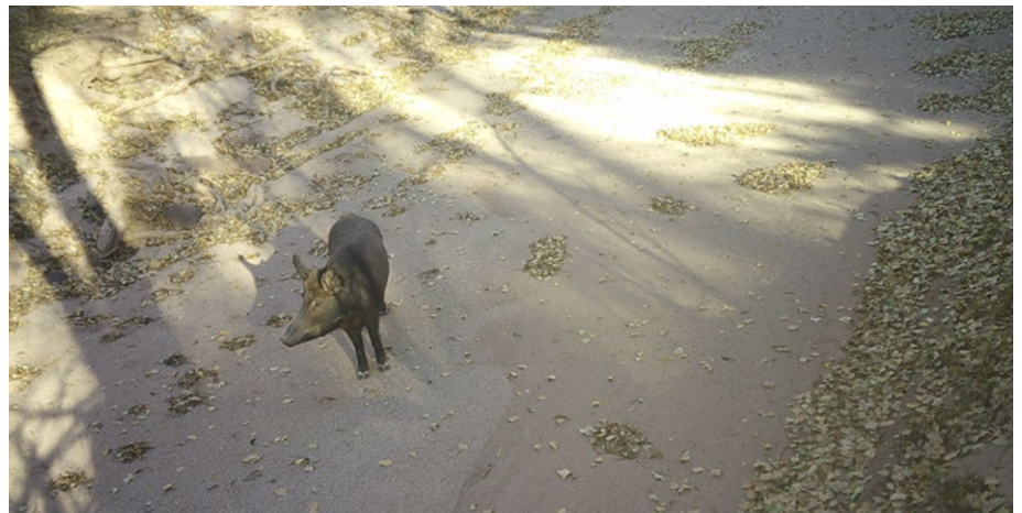
A feral pig roams the San Pedro River.

VOLUNTEER JOE PAGE keeps eight CCA cameras in various locations around Cascabel, recording the passing wildlife, and also keeping track of invasive species like feral pigs.