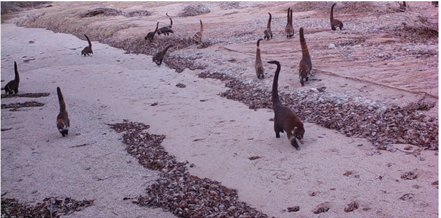
Coatis at dawn